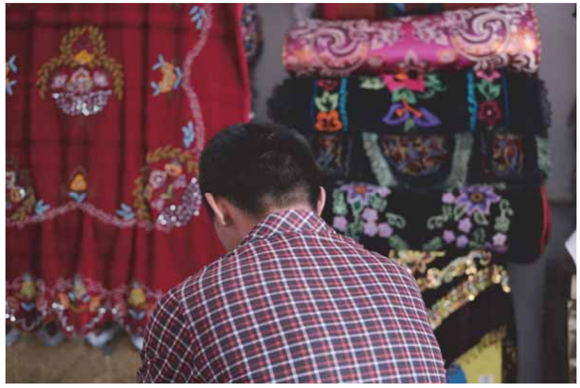
An interviewee says that his younger brother and sister have both been taken to political education camps.

In some cases, it is the former employers who convey the message. Garri, 78, residing in a country bordering China, told Human Rights Watch that four close family members have been told to go back to China that way: