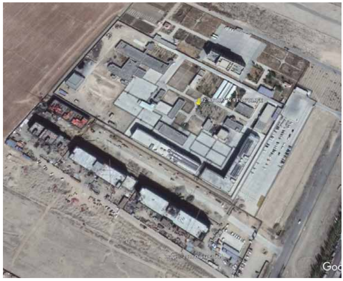
Satellite imagery of a political education camp in Hami, Xinjiang. It was converted from a disease control center.

[The guards] then cut the hair of the girls. There were some girls with long braided hair [but it was] all cut. [The girls...] thought they were going to be released. The girls were all smiling and happy [when they went out] ... but they came back crying and wailing. I was crying with them. I was against this, and I said, 'Why did you do this?' The guards said, 'Why do you care about women's hair?' I must have cursed the guards and ... they made me stand up straight for 24 hours.... There were many days when I was punished by standing up for 24 hours.