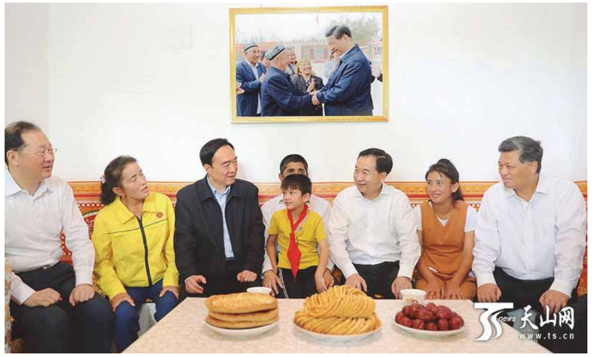
Xinjiang Party Secretary Chen Quanguo (third from left) in a state press photo visiting a Turkic Muslim family in Xinjiang.