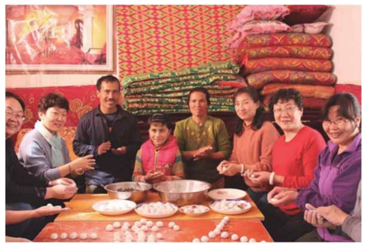
A State press photo showing Chinese officials staying with Turkic Muslim families during compulsory homestay "Becoming Family" program in Xinjiang.

Official reports about these programs say the length of the stays depend on the political trustworthiness of the families. Those who are considered suspicious are subjected to lengthier, or more frequent, stays: