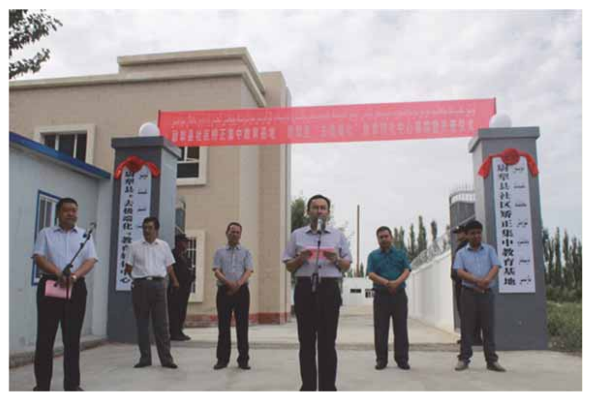
Officials unveil a new political education camp in Bayingolin, Xinjiang.