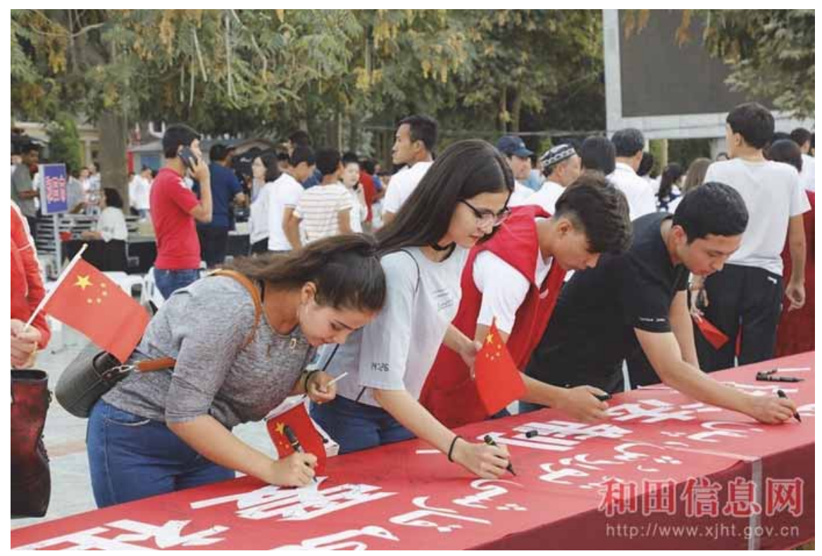
Students sign their names on a banner that reads, among other slogans, "Love the Motherland" in Hotan, Xinjiang.

Iham also described to Human Rights Watch examples of these denunciations: