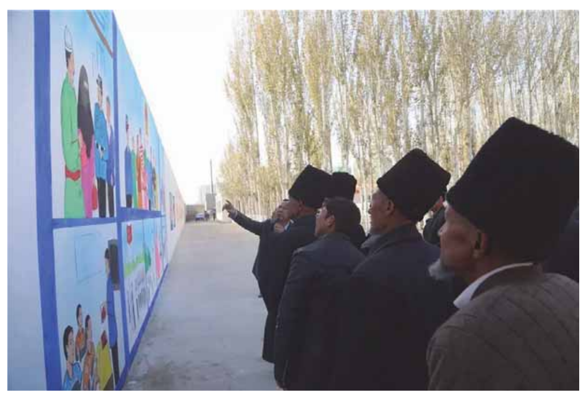
Officials bring villagers on tour outside a political education camp in Hotan.

During their "education," detainees were required to sit long hours on stools or chairs that were not comfortable, and not allowed to move. Rustam said: "During the day, we had to sit on stools...Between 8 a.m. to noon we weren't allowed to move freely... At 2 p.m. we would be made to study [sitting on stools] until evening.<sup>98</sup>