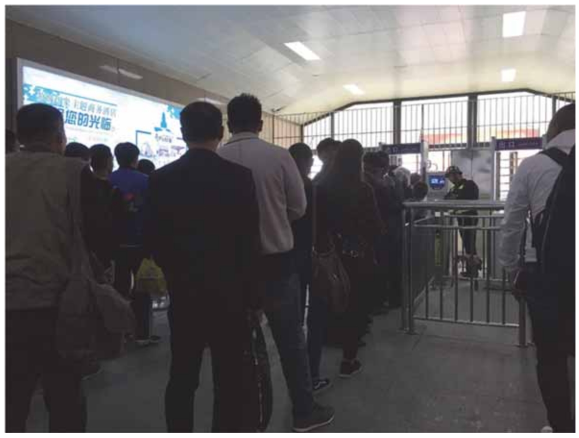
A checkpoint equipped with facial recognition in Turpan, Xinjiang. The photographer noted that police let Han through a fast lane without checking them while Turkic Muslims were in long lines waiting for a thorough security check.

One person told Human Rights Watch that he was at an official meeting when the authorities discussed these "green channels":