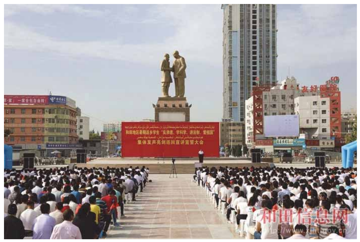
Over 5000 students pledge loyalty to the "Motherland" in a July mass ceremony in Hotan, Xinjiang.

On Monday flag ceremony, you have to show your ID, or if you miss several times in a row, someone would tell on you and then you'd be punished.<sup>152</sup>