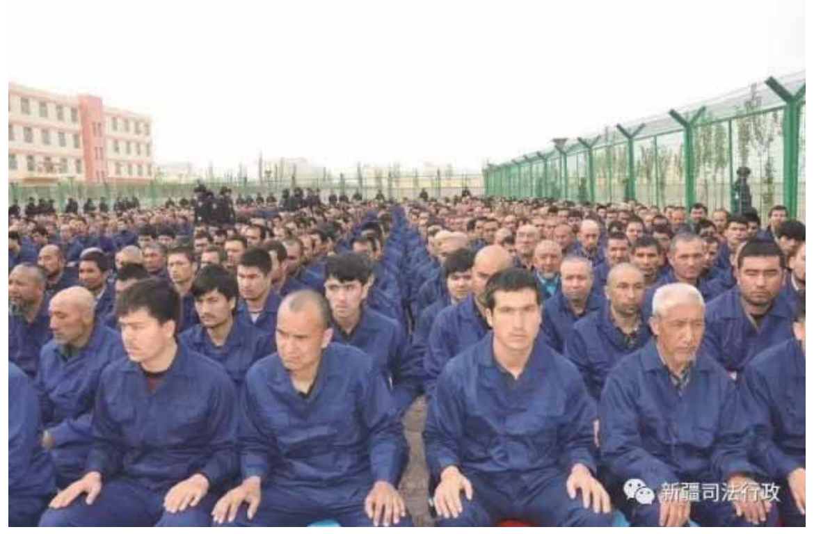
Government social media post in April 2017 shows detainees in a political education camp in Lop County, Hotan Prefecture, Xinjiang.

Interviewees told Human Rights Watch that their fellow detainees were held in political education camps for having relationships with people in the list of 26 foreign countries, or for having practiced Islam. Erkin told Human Rights Watch: