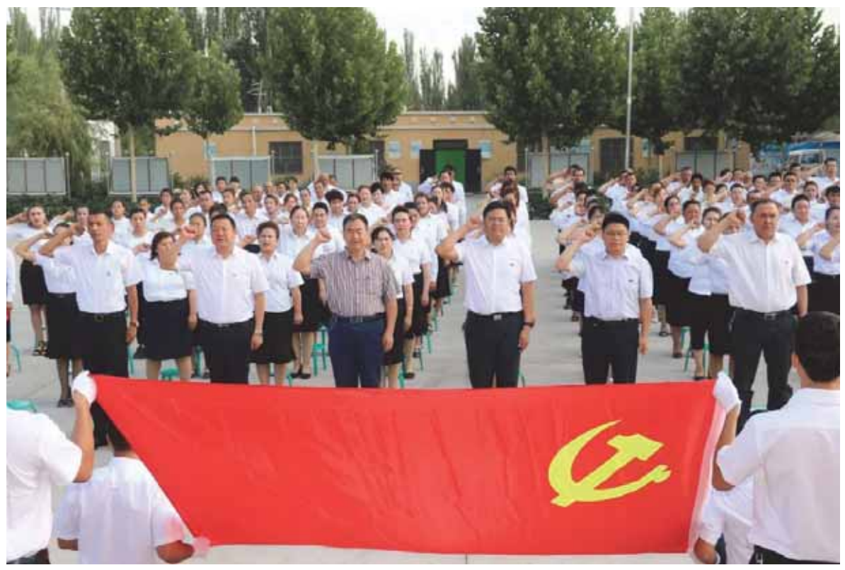
Village officials swear allegiance to the Chinese Communist Party in Kashgar, Xinjiang.

Under the Strike Hard Campaign, Turkic Muslims are required to attend a variety of political indoctrination gatherings. Many interviewees said everyone in their community has to attend flag-raising ceremonies with the People's Republic of China's national flag on a weekly or daily basis: